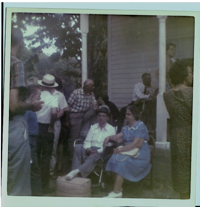
Jessee Picnic 1966