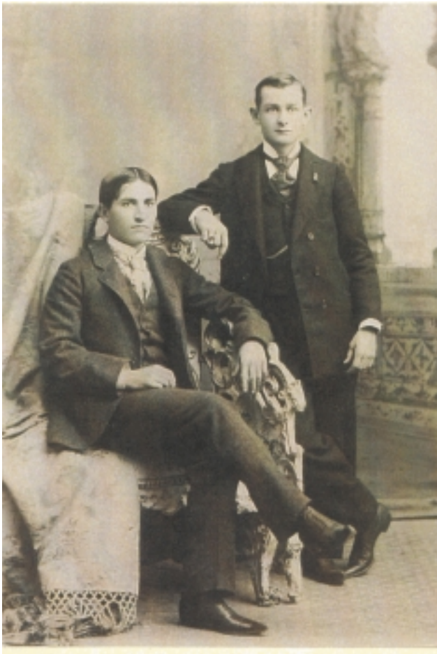
1788) in Rocky Mount, Virginia Aug 20 1810. They traveled to Missouri in the 1830's.