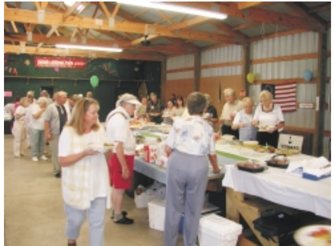
Lining up for the wonderful food at the Jessee Family Reunion