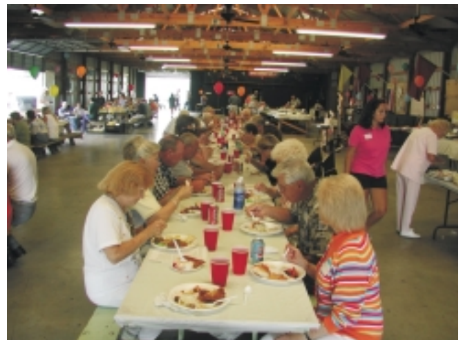
Ohio and Virginia cousins enjoying the picnic. There was plenty of good food to go around. The Jesses are fine country cooks.