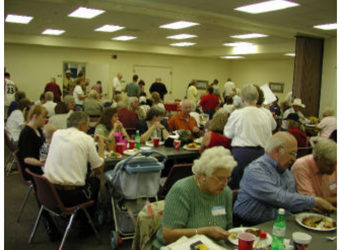
Doing what Jessees do best