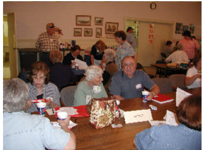
Jessee Research Day