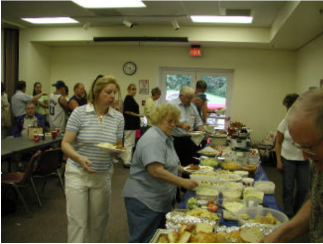
Lining up for the wonderful food at the Jessee Family Reunion