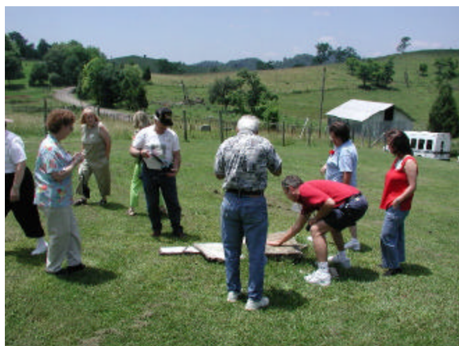
Archer Jessee Cemetery in Reeds Valley