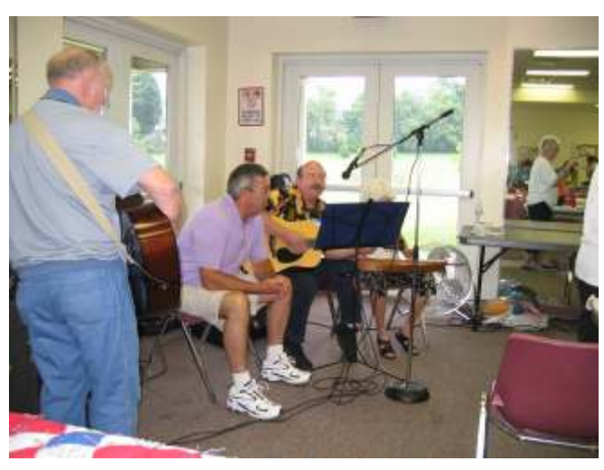
Jessee Reunion Jam Session