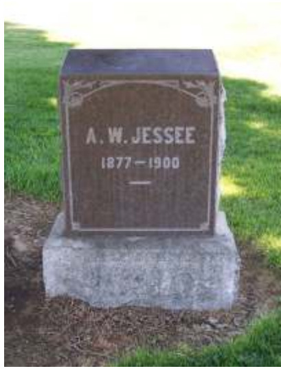
Asher W. Jessee

http://freepages.genealogy.rootsweb.com/~holton/cempics/headstones.htm