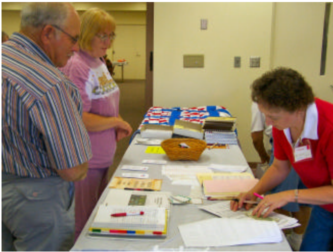
Registration Table at the 2005 Reunion