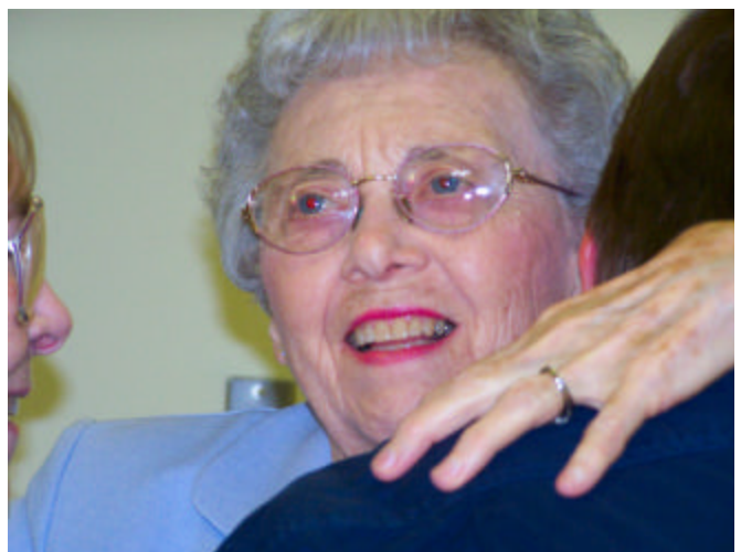
Lots of hugs for All